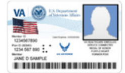
Department of Veterans Affairs