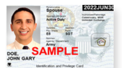
100% Disabled Veteran Guard and Reserve Dependent