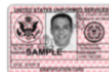
Guard and Reserve Dependent