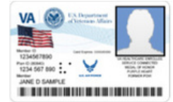
Department of Veterans Affairs