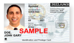
100% Disabled Veteran Guard and Reserve Dependent