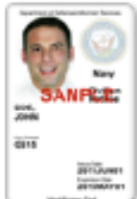
Retired APF and NAF DoD Civilian Employees