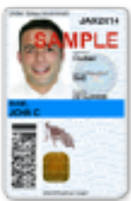
Active Foreign Affiliate (Non-U.S. Citizen)