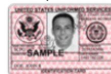
Reserve Retired National Guard Retired