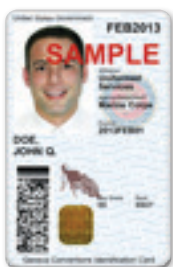
Common Access Card