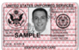
DD Form 2 (Reserve Retired)

Retired Reserves Retired National Guard Eligible