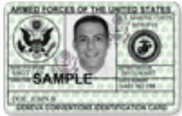
DD Form 2 (Reserve)

Eligible Service Members are active or retired members of the U.S. military, including the National Guard, Reservists, the U.S. Coast Guard, the Commissioned Corps of the U.S. Public Health Service (USPHS), and the Commissioned Corps of the National Oceanic and Atmospheric Administration (NOAA). Eligible Service Members (or their spouses) must present valid military identification pictured below.