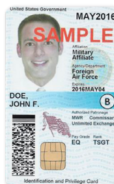
Common Access Card

Active Military Foreign Affiliate Eligible only with this ID (no other ID accepted)