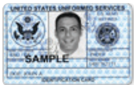
DD Form 2 (Retired)

100% Disabled Veterans Medal of Honor Recipients Some Retirees Eligible