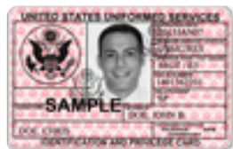
DD Form 1173-1

Retired Reserves Retired National Guard Eligible