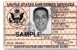
DD Form 1173

100% Disabled Veterans Medal of Honor Recipients Some Retirees Eligible