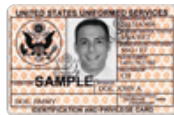
DD Form 2765

100% Disabled Veterans Medal of Honor Recipients Other Benefits-eligible Categories Eligible