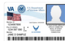
Department of Veterans Affairs