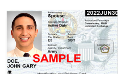
100% Disabled Veteran Guard and Reserve Dependent Active Duty Dependent Reserve Retired National Guard Retired