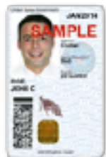
APF and NAF DoD and Uniformed Services Civilian Employees