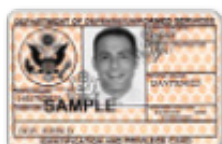
Active Duty Dependent