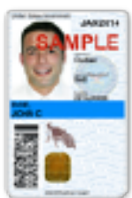
Active Foreign Affiliate