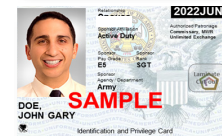
100% Disabled Veteran Medal of Honor Recipients