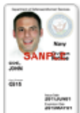
Retired APF and NAF DoD Civilian Employees