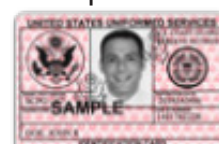
Reserve Retired National Guard Retired