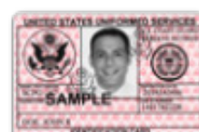
Guard and Reserve Dependent