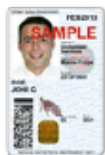
Active Duty Armed Forces