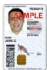
Active Duty Armed Forces