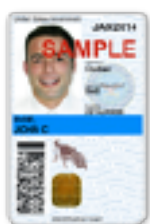
Active Foreign Affiliate (Non-U.S. Citizen)