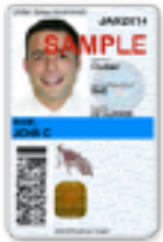
Active Foreign Affiliate