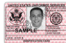
Guard and Reserve Dependent