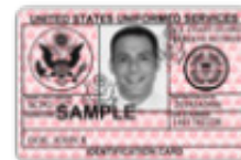
Reserve Retired National Guard Retired