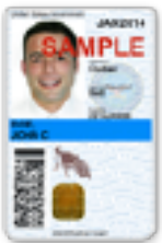
Active Foreign Affiliate (Non-U.S. Citizen)