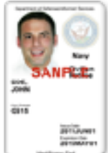
Retired APF and NAF DoD Civilian Employees