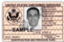
100% Disabled Veteran