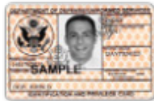
Active Duty Dependent