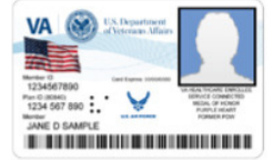
Department of Veterans Affairs