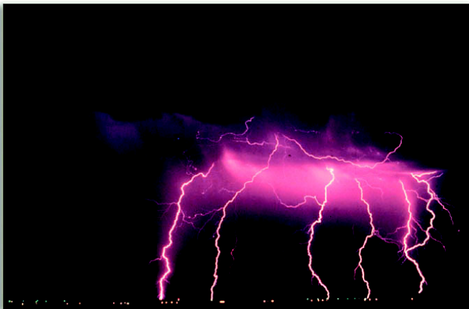
Multiple cloud-to-ground lightning strikes during a nighttime thunderstorm

The glow on a masthead produced by an extreme buildup of electrical charge is known as St. Elmo's Fire. Unprotected mariners should immediately move to shelter when this phenomena occurs. Lightning may strike the mast within five minutes after it begins to glow.