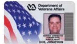
100% Disabled Veteran Guard and Reserve Dependent