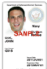
Retired APF and NAF DoD Civilian Employees