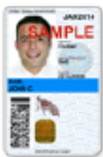
Active Foreign Affiliate (Non-U.S. Citizen)