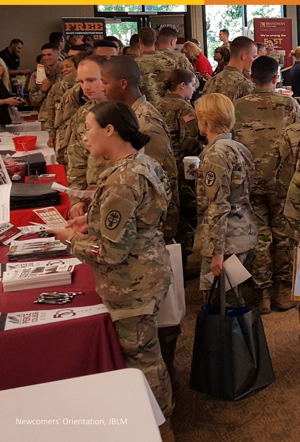
Newcomers' Orientation, JBLM