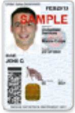
Active Duty Armed Forces