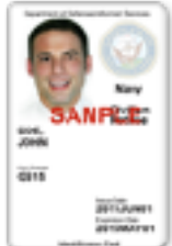
Retired APF and NAF DoD Civilian Employees