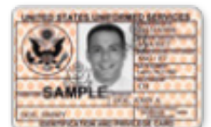
100% Disabled Veteran Medal of Honor Recipients