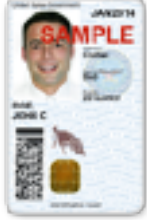
APF and NAF DoD and Uniformed Services Civilian Employees