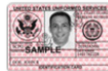
Reserve Retired National Guard Retired