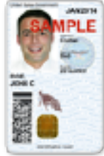
APF and NAF DoD and Uniformed Services Civilian Employees