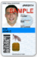
Active Foreign Affiliate (Non-U.S. Citizen)