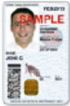
Active Duty Armed Forces