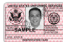
Guard and Reserve Dependent