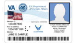
Department of Veterans Affairs