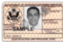
Active Duty Dependent