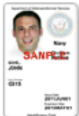
Retired APF and NAF DoD Civilian Employees