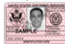
Reserve Retired National Guard Retired