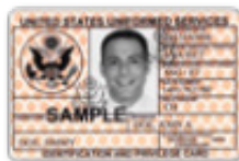
100% Disabled Veteran