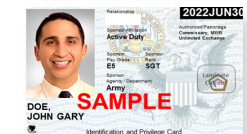
100% Disabled Veteran Medal of Honor Recipients