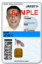
Active Foreign Affiliate (Non-U.S. Citizen)