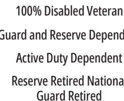
Active Duty Dependent Reserve Retired National Guard Retired