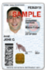
Active Duty Armed Forces

Vendor specific eligibility requirements may apply