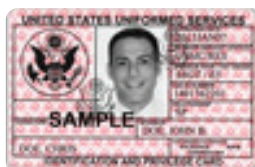
DD Form 1173-1

Retired Reserves Retired National Guard Eligible