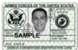
DD Form 2 (Reserve)