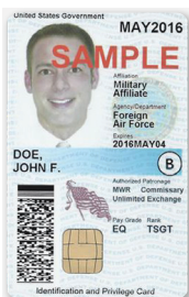
Common Access Card

Active Military Foreign Affiliate Eligible only with this ID (no other ID accepted)