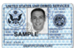
DD Form 2 (Retired)

100% Disabled Veterans Medal of Honor Recipients Some Retirees Eligible