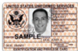
DD Form 1173

100% Disabled Veterans Medal of Honor Recipients Some Retirees Eligible