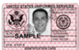
DD Form 2 (Reserve Retired)

Retired Reserves Retired National Guard Eligible