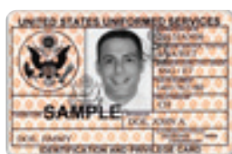
DD Form 2765

100% Disabled Veterans Medal of Honor Recipients Other Benefits-eligible Categories Eligible