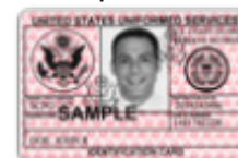
Reserve Retired National Guard Retired