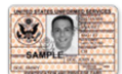
100% Disabled Veteran Medal of Honor Recipients