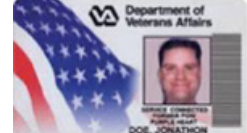
100% Disabled Veteran Guard and Reserve Dependent