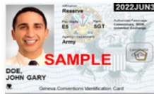
100% Disabled Veteran