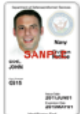
Retired APF and NAF DoD Civilian Employees