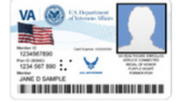
Department of Veterans Affairs